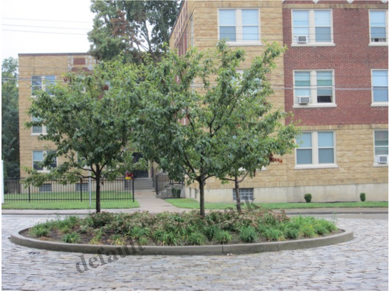
Roundabout at Dana & Clinton Springs