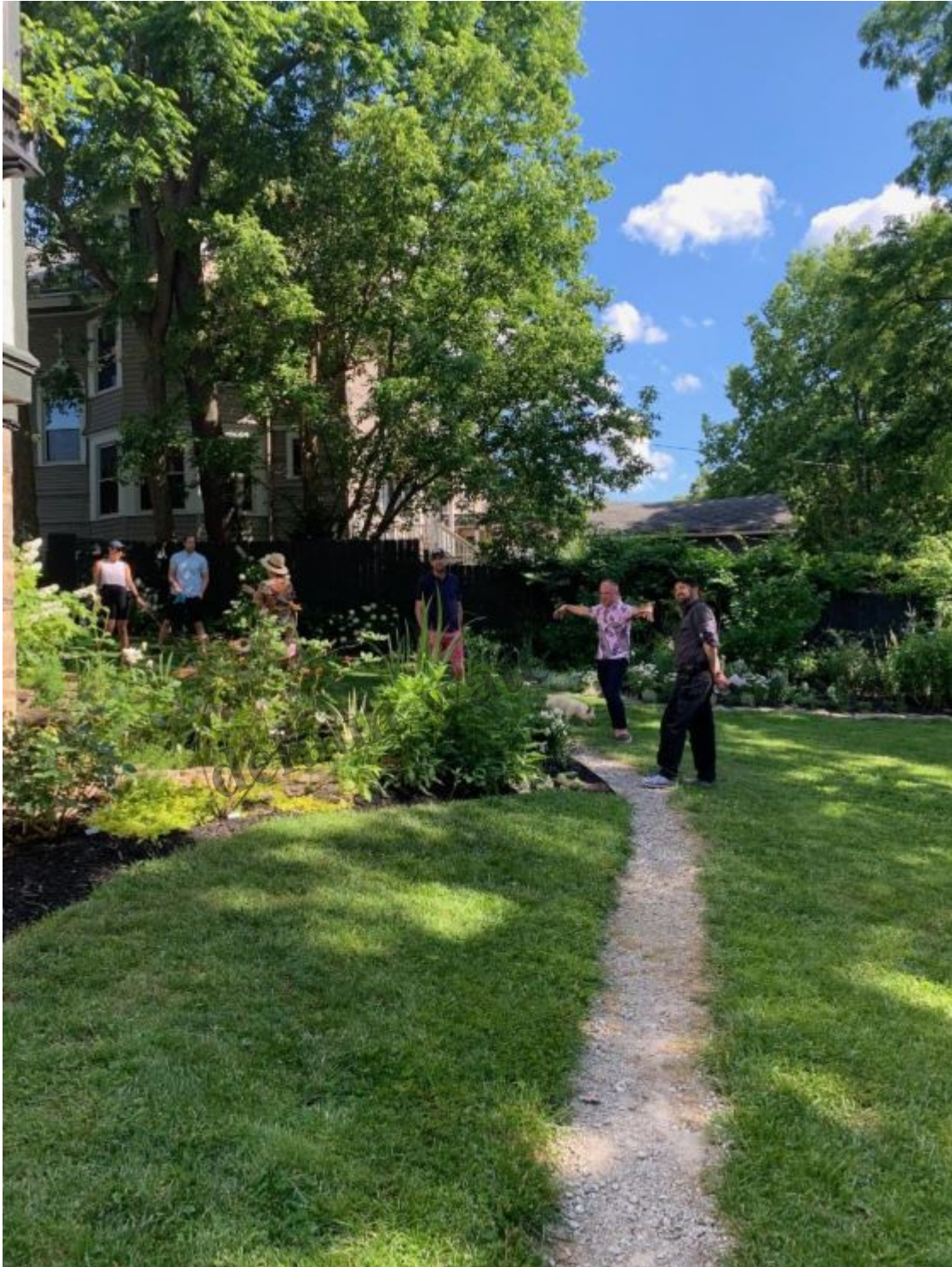
People enjoying the tour