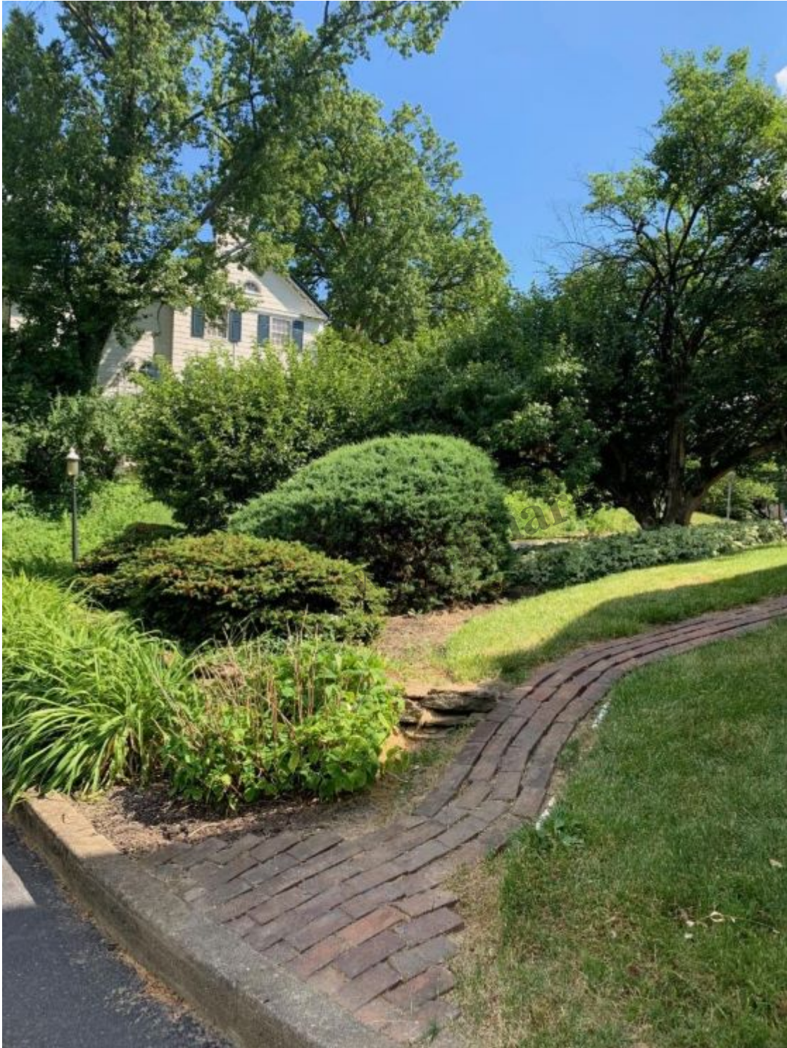
Rose Hill (Geoppinger)