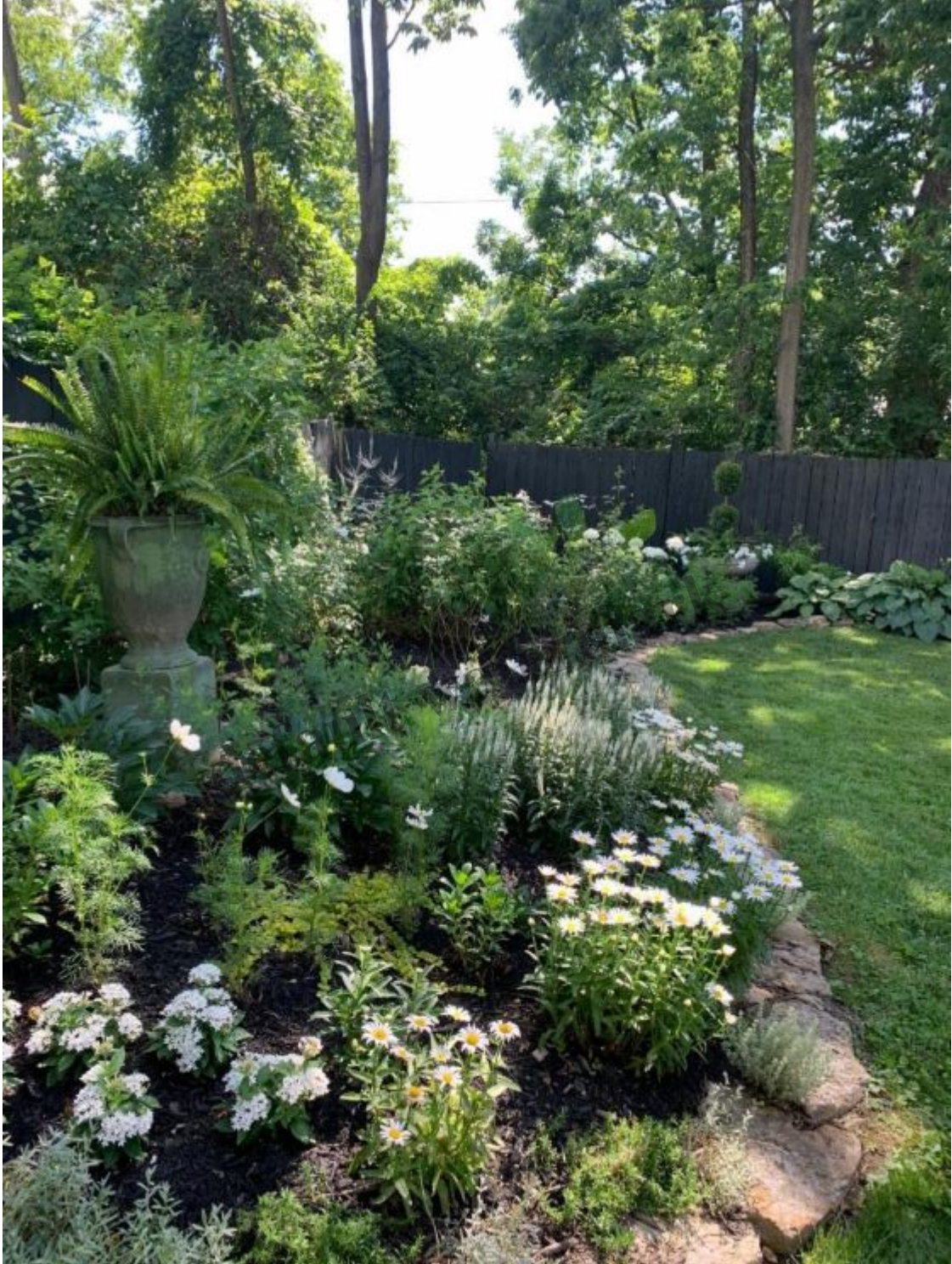
Beechwood (Hinger and Goodpaster)