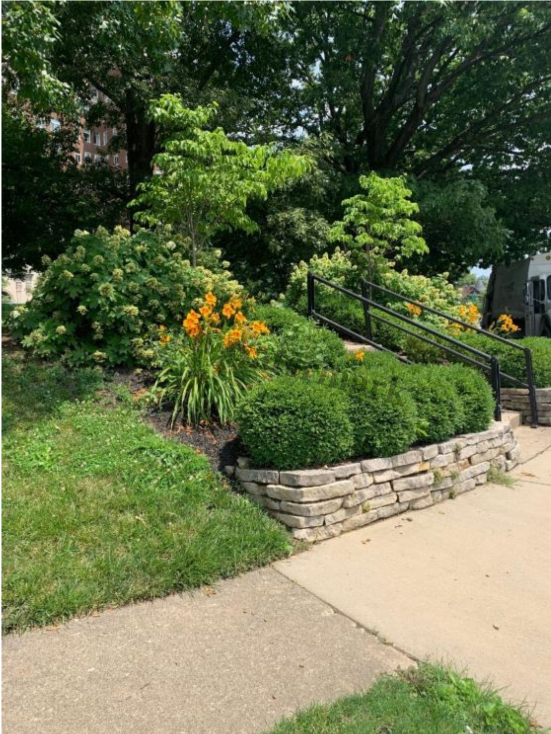
The Mitchell Triangle (Belvedere)