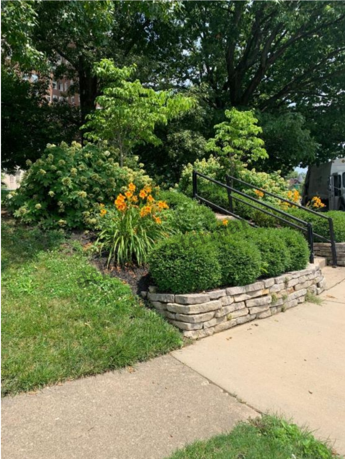
The Mitchell Triangle (Belvedere)