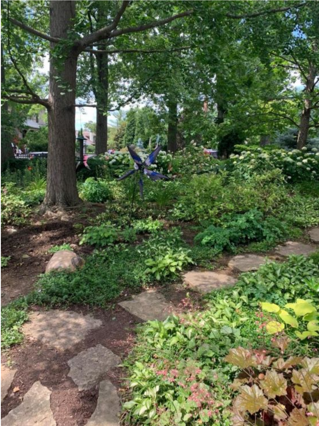
Rose Hill (Jackson)