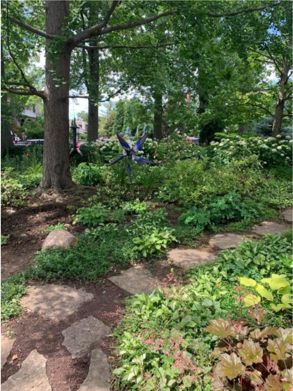
Rose Hill (Jackson)