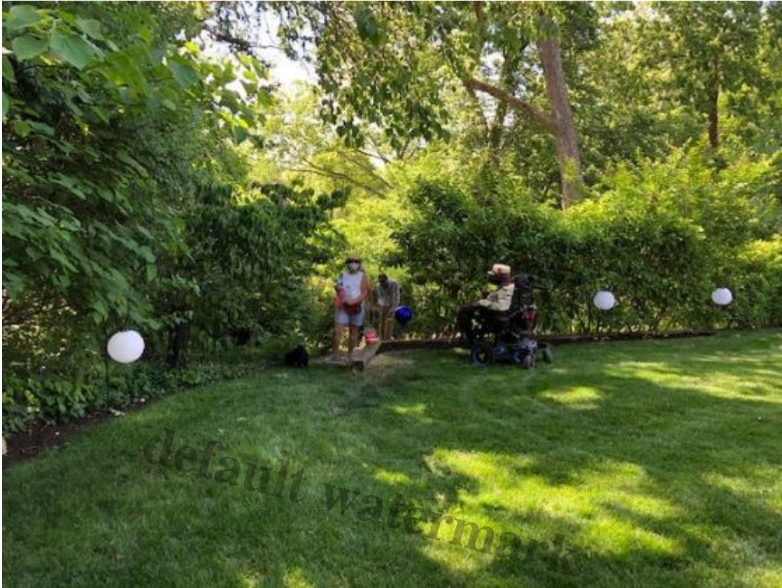
Rose Hill (Krzeski)