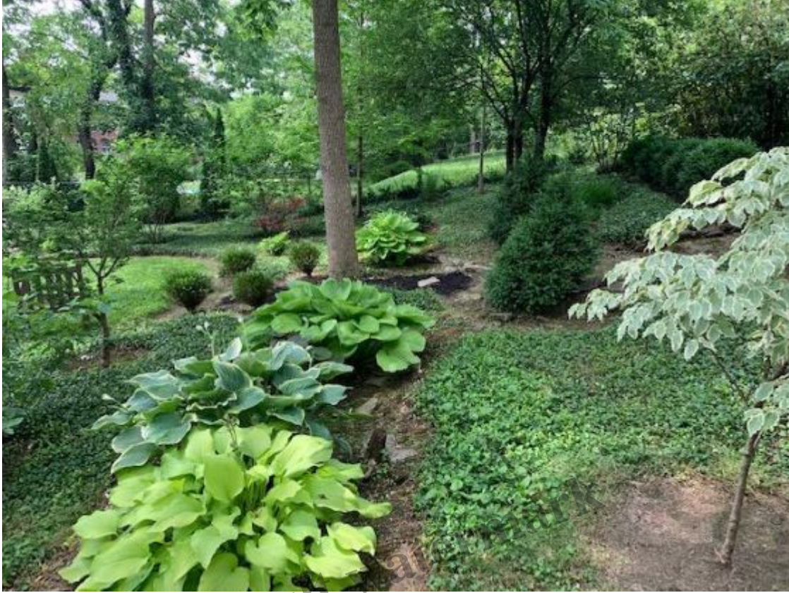
Beechwood (Struebee and Swift)