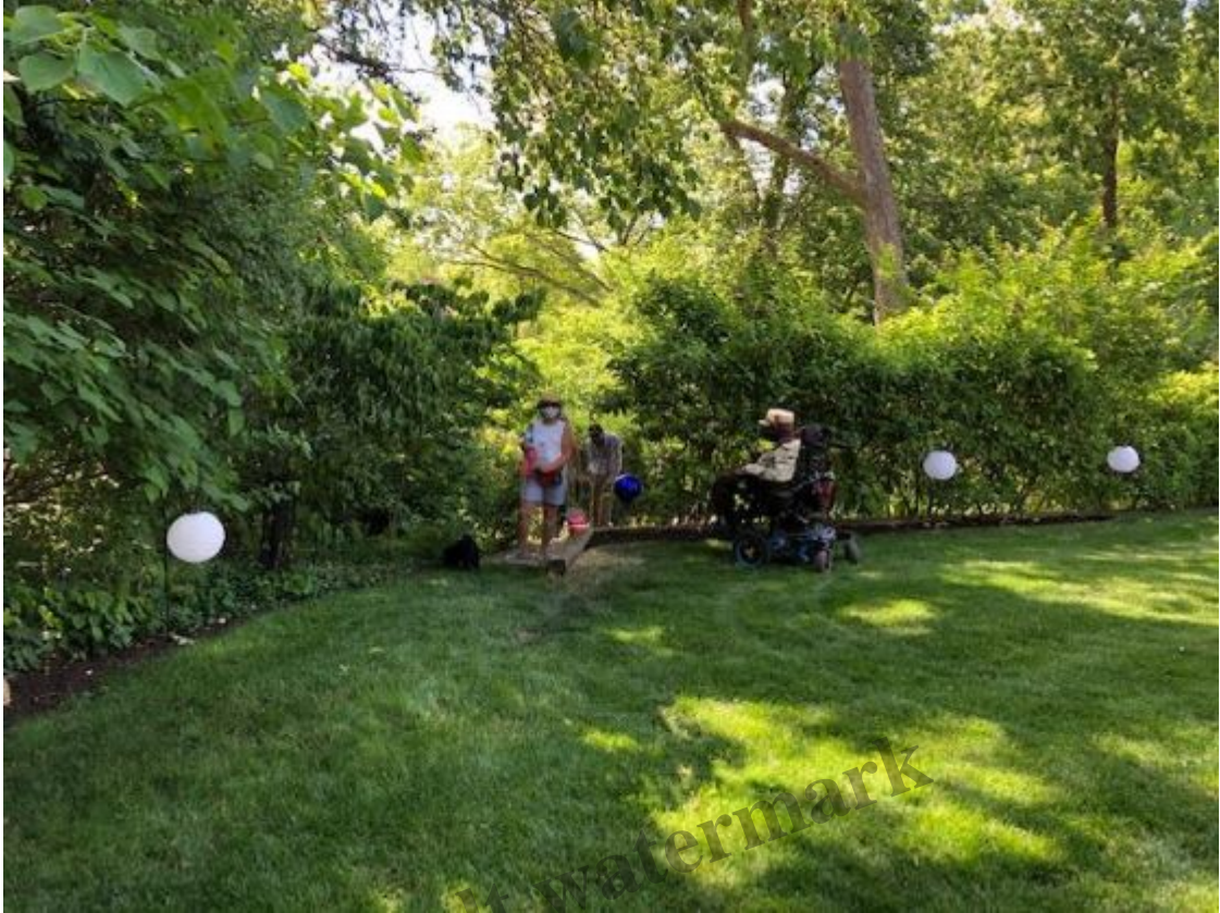
Rose Hill (Krzeski)