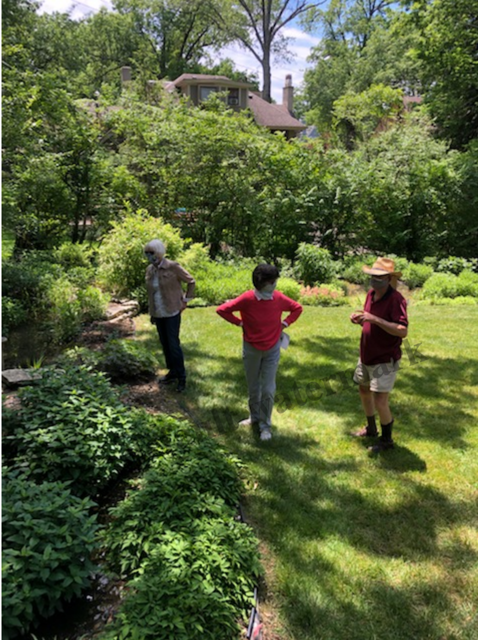
Burton Woods Lane (Blaney)