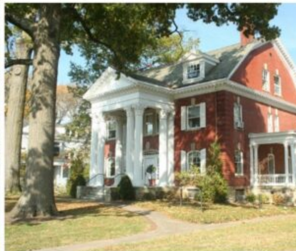
Photo 6. 4032 Rose Hill Avenue (1911), A. F. Maish House, Elzner, Neoclassical.