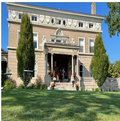
Photo gallery: North Avondale community event Porch Fest debuts in September