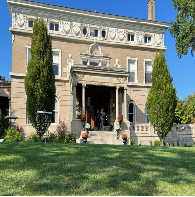
Photo gallery: North Avondale community event Porch Fest debuts in September