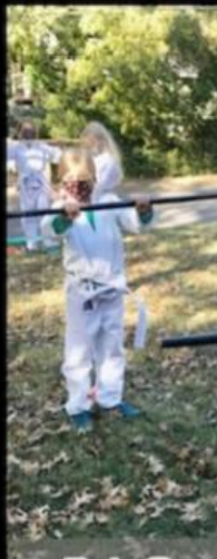
tudents enjoyed an outdoor alternative while awaiting reopening. Classes had been canceled since