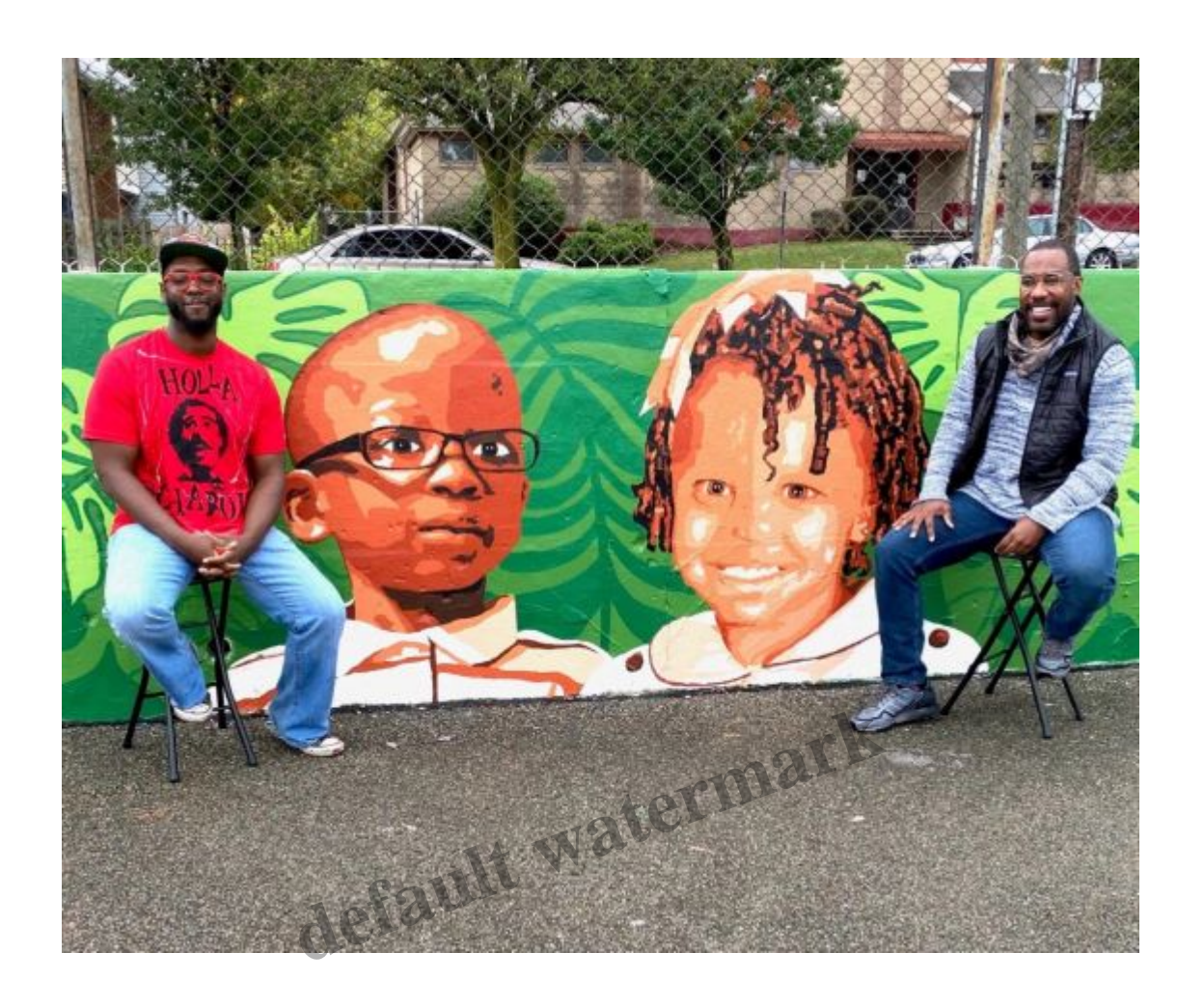
Date Created November 1, 2020 Author northavondale