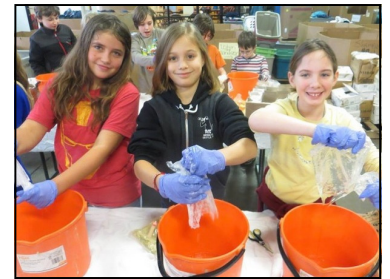
Students prepare liquid soap for humanitarian aid at Mathew 26.