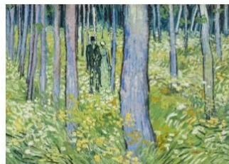
van Gogh's work

Just as musicians are inspired by each others' work, borrowing phrases and musical innovations that move them, artists also learn from each others' techniques and interpretations of nature, light and lines. New School Montessori kindergartners held an art show this spring showcasing their own work that was inspired by Kandinsky, Monet, Picasso, Kahlo, van Gogh, Basquiat, and even the cave paintings of Lascaux.